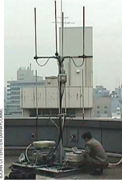
First SA base station of ArrayComm for cellular mobile communication networks (Asian PHS Standard), available since 1997.

Extrapolating Edholm's law shows that SA/MIMO technologies are not far away. Indeed, for IEEE 802.11n, there are several MIMO proposals submitted for data rates up to 108 Mb/s. A data rate of 500 MB/s is envisaged as an optional part of IEEE 802.11n, which should be available by 2007 and therefore even outruns the prediction by Edholm's law. Moreover, release 4 of UMTS includes transmit diversity, and release 6 will probably include a MIMO extension to HSDPA.